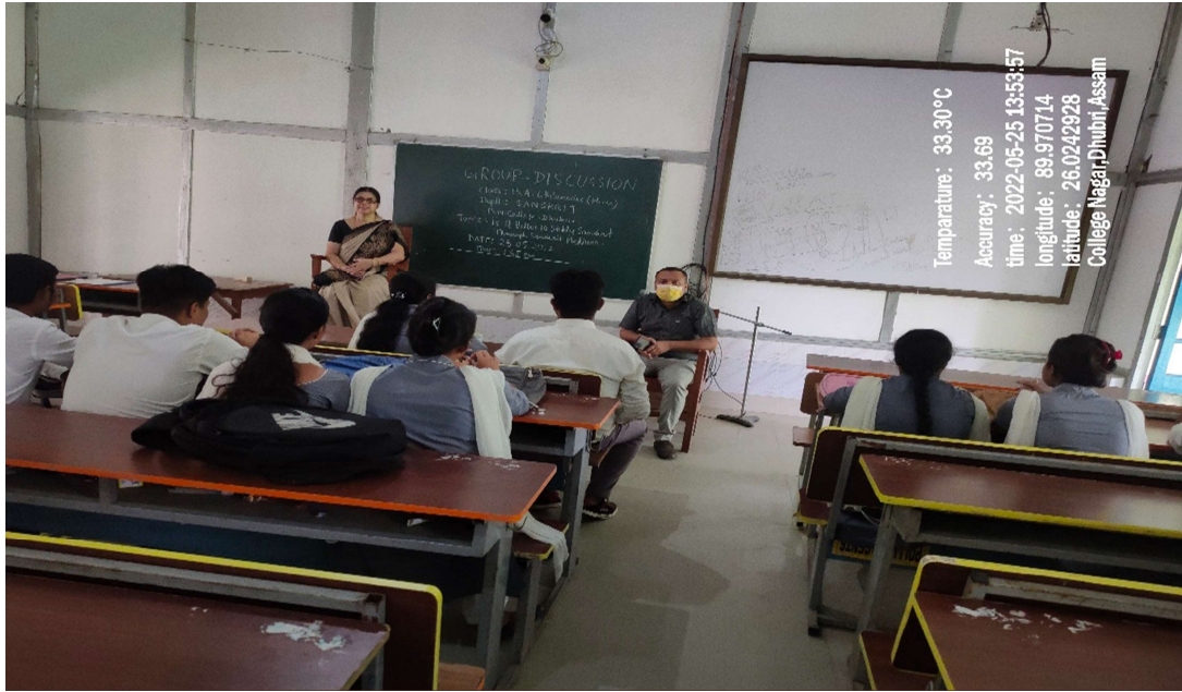
Faculties of Sanskrit Department present in the Group Discussion